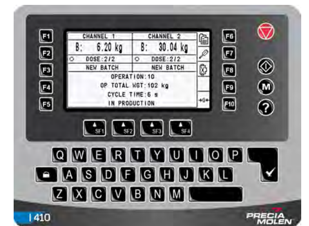
Dual weigher view

The F5 and F10 function keys are used to select the information displayed in each column.