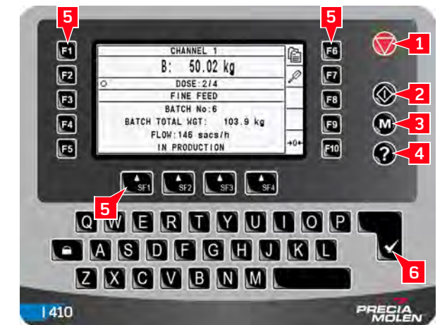
Single weigher view